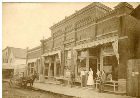
H.F. Bullens Store, 221-227 Water Street, ca. 1902.

Respectfully submitted by Tim Caron, HPC Commissioner.