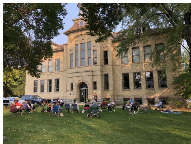
Members gathered outside of the old Excelsior Public School building on 261 School Ave.