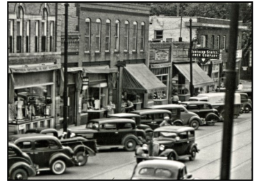
Water Street in Excelsior, 1937.

Log on to Facebook or Instagram every Wednesday to see a mystery historic building or event from Water Street. Write your guess in the comments section along with any memories you have that pertain to that building, place, or event. The answers for the mystery image will be posted the following week along with a new image for the current week. The memories that are shared will be collected and preserved for future generations.