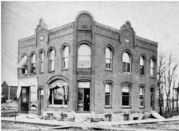
Ball's Bank Block, 300 Water Street, ca. 1891

year. The following October the local paper still carried ads to rent the rooms under the bank for a dress-making parlor or restaurant. McDonald returned in 1896 to operate a hotel with a capacity for about 10 people.