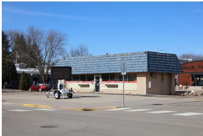
Vacant Pump Gas Station, 300 Water Street, March 31, 2020.