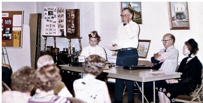
An early ELMHS program, 1972

And finally, after being awarded a Heritage Partnership Grant from the Minnesota Historical Society in 2020, the Society has begun an exploration of strategic alignment options with four other historical societies guided by an experienced non-profit organization consultant. This initiative is still underway, and the participants are excited to be working proactively to preserve our shared