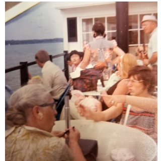
1973 "Lady of the Lake" History Cruise

Topics and tick information will be available the month prior to each cruise at elmhs1.eventbrite.com .