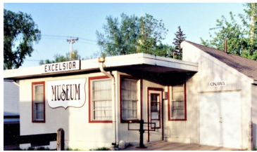
ELMHS Museum in 1992

Help us keep the museum open by volunteering to host at least one Saturday or throughout the summer. No experience necessary. Training will be held on May 14. Learn more and sign up at www.elmhs.org/volunteer.html .