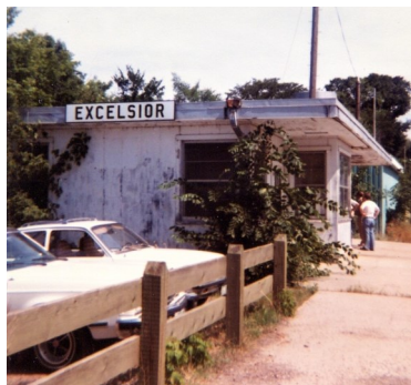
Future ELMHS Museum, 1982 Detail/entities/18467 .