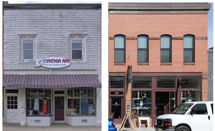
244 Water Street, Excelsior, 2004 and 2018