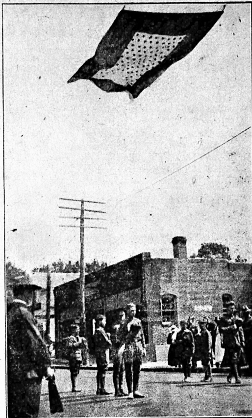
"Minnetonka Record," May 24, 1918.

[Excerpted from "Minnetonka Record," Friday, Oct. 25, 1918]