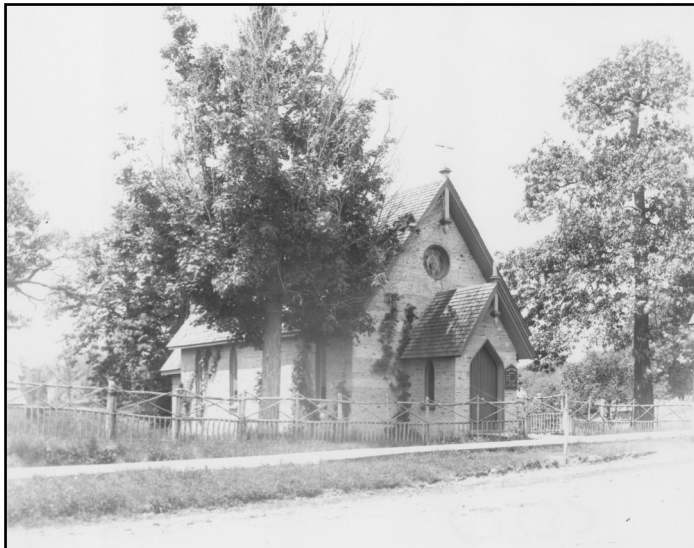
Trinity Chapel on Third Street, Excelsior.

Built in 1862-1863, Trinity Chapel is the oldest church building and the second oldest congregation in the Lake Minnetonka area. Learn about the people who made it possible, including the not particularly pious upheaval of the Episcopal diocese of Minnesota.