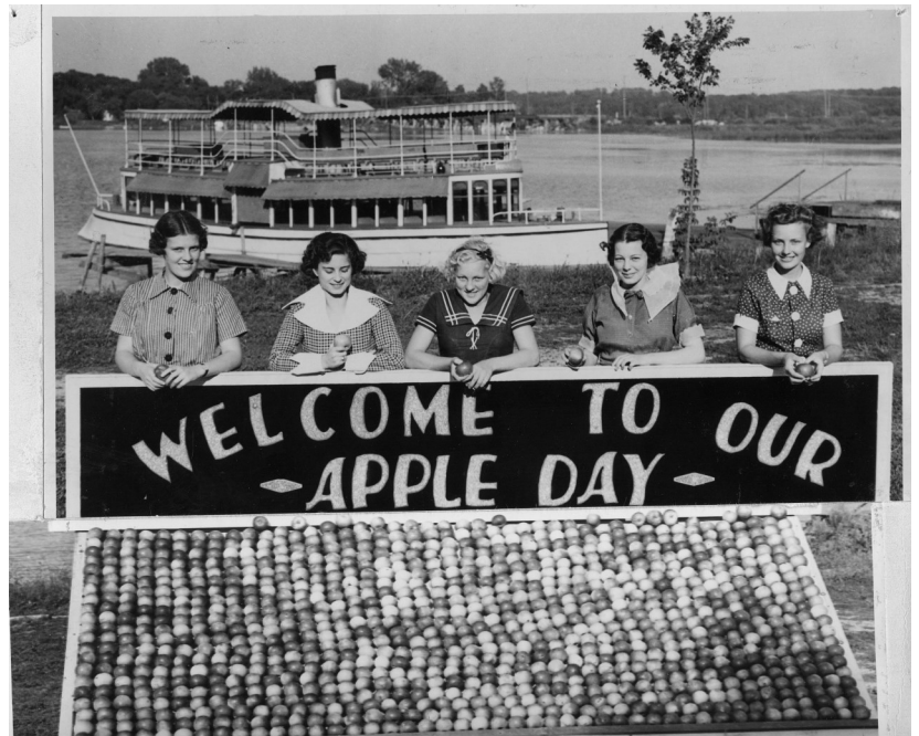
Apple Day 1935