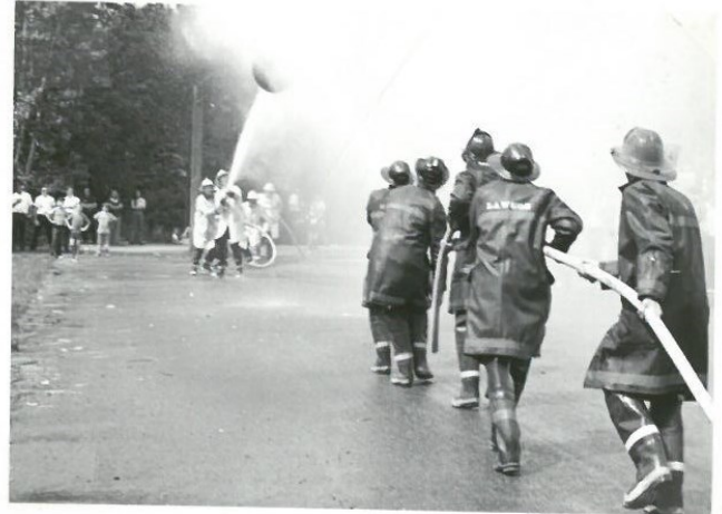
Fire Department Water Fight; Courtesy of Excelsior Fire Dept.

At high noon, Excelsior District fire apparatus, old and new, along with fire trucks from other fire departments will parade down Water Street in downtown Excelsior. They will be joined by other organizations that are a part of, support, or are involved with the Emergency Response System. Ambulance services, the Salvation Army, and the DNR will all be part of the biggest fire truck parade since the Minnesota State Fireman's Association Convention in the 1930's. Citizens can see over a dozen pieces of apparatus that are currently part of the EFD fleet, a fleet that began with a big hook and a single ladder.