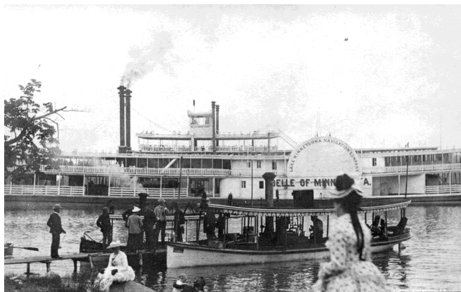
"Belle of Minnetonka" with "Hebe" in foreground at Lake Park Hotel docks 1882.

Historian Aaron Isaacs of the Minnesota Streetcar Museum will tell the story of how early steamboats navigated the lake long before the Twin City Rapid Transit Co launched its iconic streetcar boats like the "Minnehaha." He is co-author of the book "Twin Cities by Trolley."