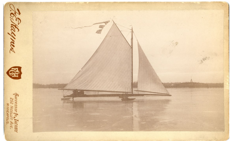
Ice Boat "Reindeer" on Lake Minnetonka