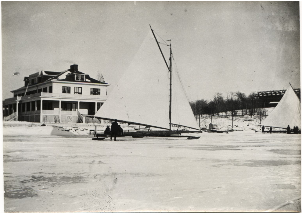
Minnetonka Ice Yacht Clubhouse St. Louis Bay. Burned in 1904. .