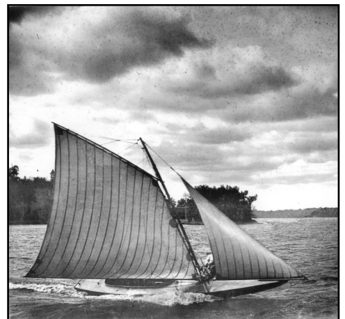
The Onawa on Lake Minnetonka, 1893.

Order online at elmhsfundraiser.eventbrite.com