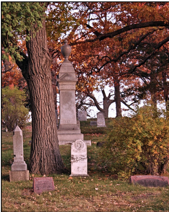
Oak Hill Cemetery, 2017.