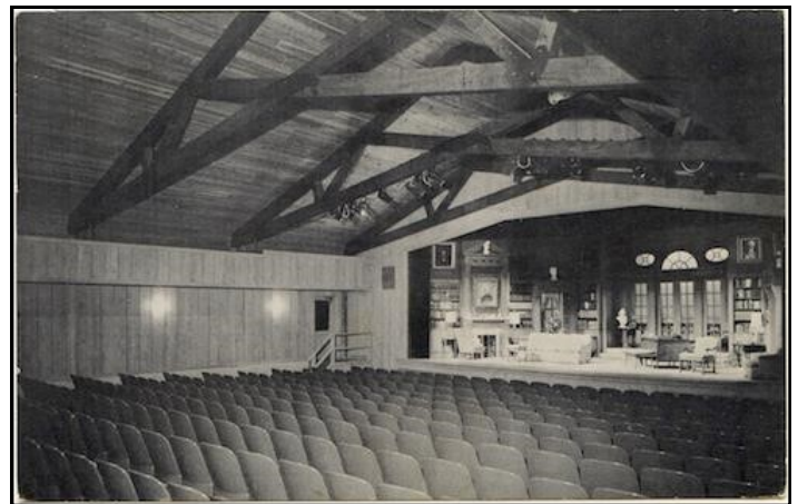
Postcard image of the Old Log Theatre, 1963. The caption reads, "The Most Beautiful Theater in the Country."